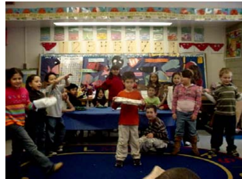
Play production by 1st graders

... the Pershing PTA sponsored an assembly called “Count on Me” to help students better understand what actions demonstrate responsibility, the second Pershing behavioral expectation.